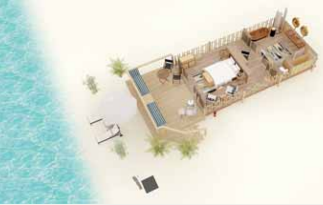
TENTED BEACH SUITE