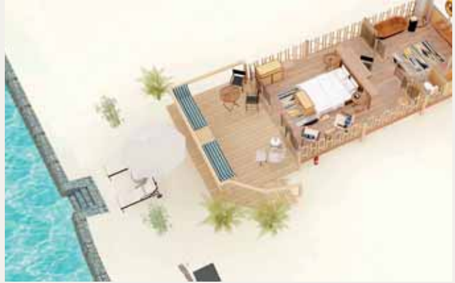
TENTED OCEANFRONT SUITE