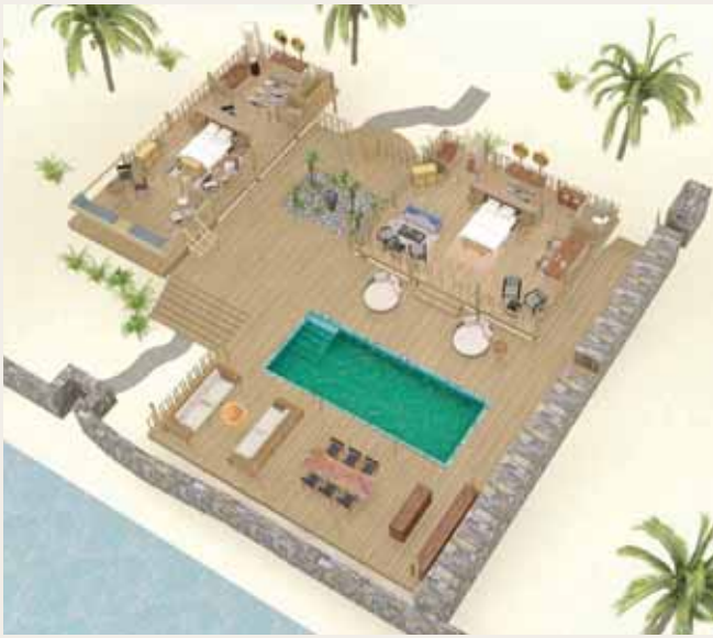
TWO-BED DELUXE POOL VILLA