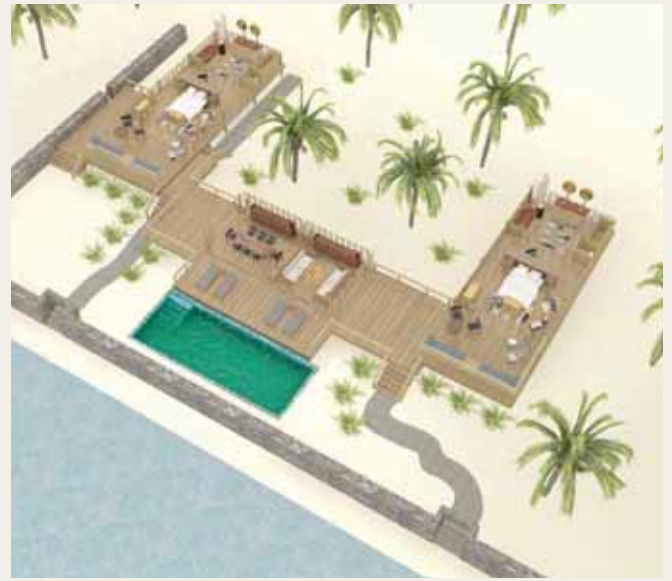
TWO-BED INFINITY POOL VILLA