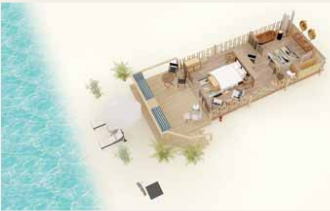
TENTED BEACH SUITE