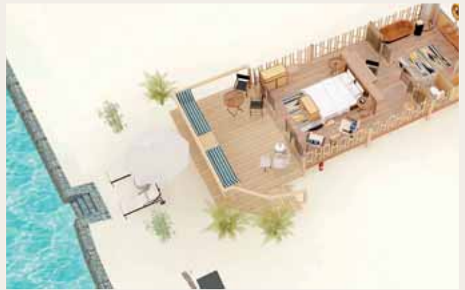
TENTED OCEANFRONT SUITE